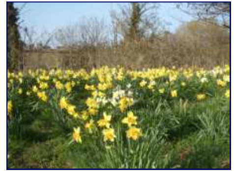
Spring Daffodils— Bridgewater UK