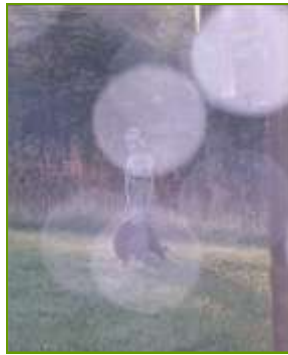
Meet Star Bear the Cat that Orbs follow © Alison Carter West Virginia USA